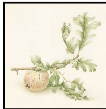
Valley Oak with Oak Gall

www.friendsofthechicostateherbarium.com/eventsviewcalendar/