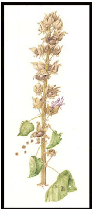
Hollyhock Seed Pods