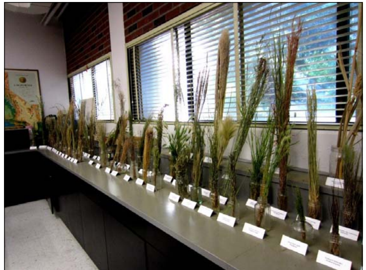
Line-up of grasses at one of John's previous workshop

Dried specimens of more than 20 genera and 45+ species will be provided for participants to key together as a group and as individuals. Emphasis will be placed on terminology and morphological features used to circumscribe genera and distinguish select species, using the keys in The Jepson Manual 2 nd Edition . As we work through the material, participants are encouraged to make “reference specimens” with index cards and clear tape. Beginners and the more-advanced wishing to “brush-up” are invited. Please bring forceps (tweezers), dissecting needle, and a 6" millimeter ruler. If possible, bring a copy of The Jepson Manual 2 nd Edition (we have several copies to loan to those who need them); we can direct you to sources for The Jepson Manual if you contact us ahead of time.